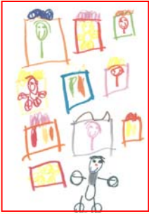
Presents with Puppets, Crayons and Bears with Santa.